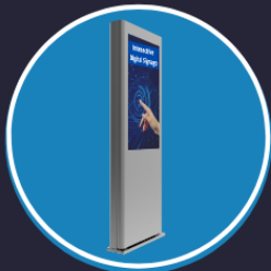
PRESENZA LITE page 3