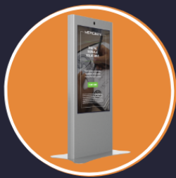
PRESENZA page 7