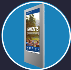
PRESENZA WALL MOUNT page 4