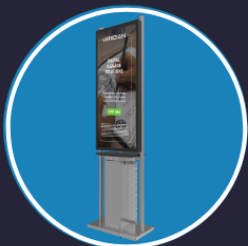
ISERIES DS page 5