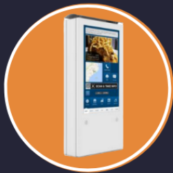
VIC page 8