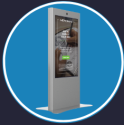
PRESENZA page 2