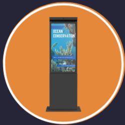
PULSE page 9