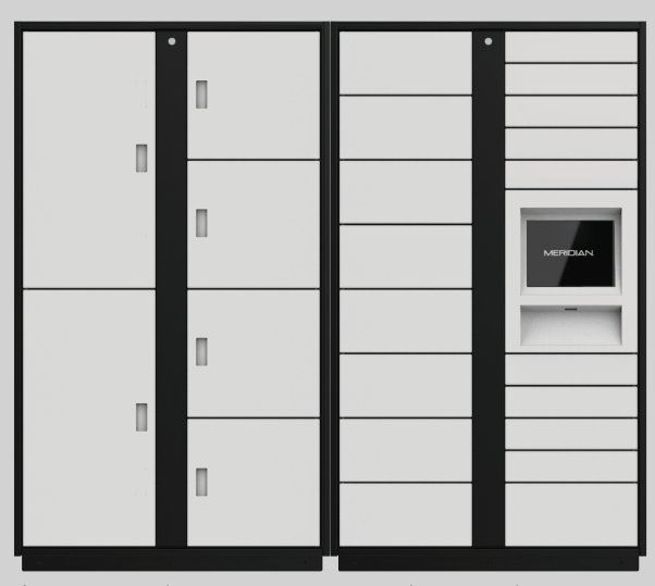
*Maximum door size= 16"w x22"d x 34.75"h

Provides real time tracking and accountability for all company owned products and tools with Meridian's Asset Management Solution. Accommodates items ranging in size* such as keys, laptops, monitors, and power tools. Designed to empower your hybrid office by offering contactless transactions between departments with the ability to schedule and reserve assets.